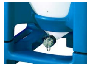
DN50 & DN80 butterfly valve ss 316