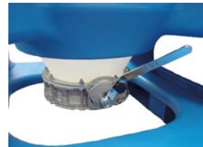
DN300 butterfly valve stainless steel 304 with aluminium body