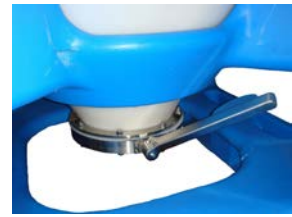
DN300 Butterfly valve ss 316